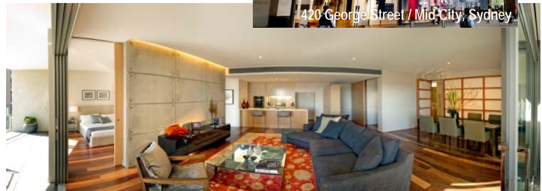
Silk apartments, Jacksons Landing