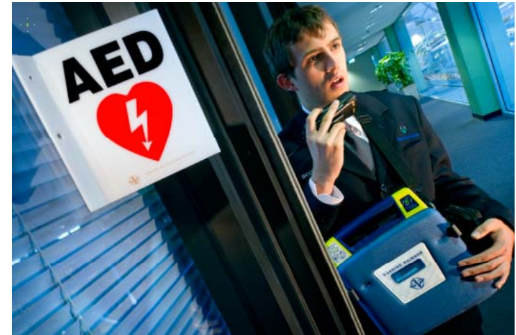
Macarthur Square, Sydney