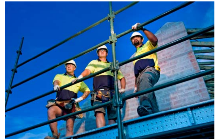
Nelsons Ridge, Sydney